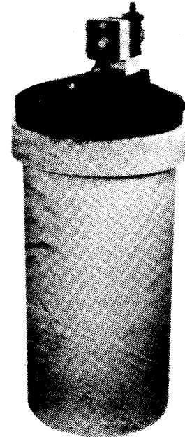
Model No. 26350